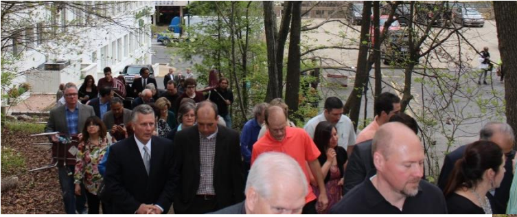
The Centennial Celebration attendees, at the conclusion of the event, move in progression up a trail on a Hot Springs hillside to the location where the infamous photo of the 1914 founders was taken. There, they pose for a new photo to mark the launch of the second century of the Assemblies of God Fellowship.