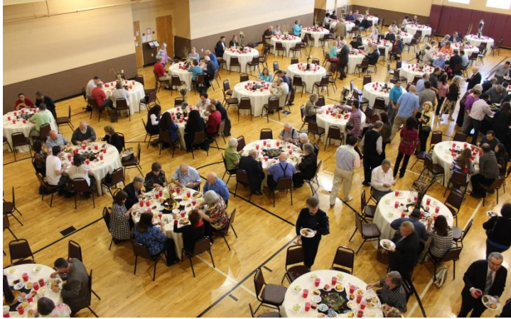
Event participants enjoy a great meal, prepared by the Light for the Lost steak team, in First Assembly's fellowship hall.